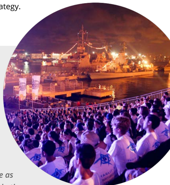
Birthright Israel 13th anniversary event.

There are a number of significant factors and realities that any foundation debating time should consider. Here are five that we’ve observed as important to the thought process: