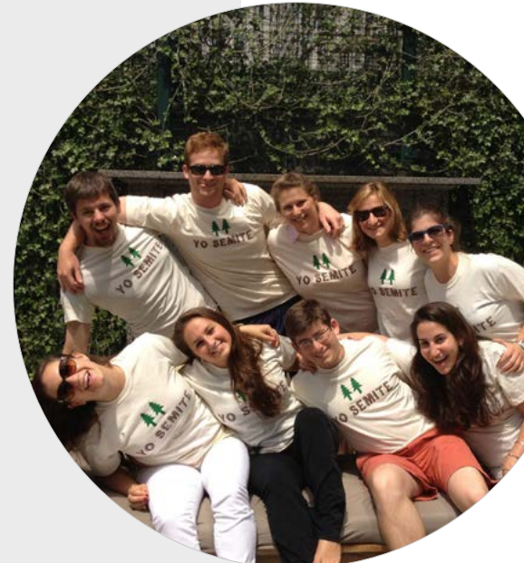
Participants in Grand Street's 10th cohort retreat.